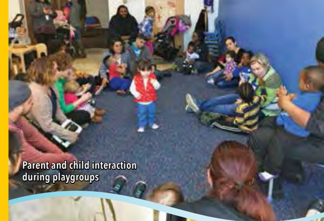
Parent and child interaction during playgroups