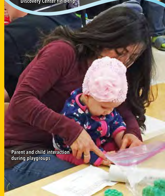
Parent and child interaction during playgroups