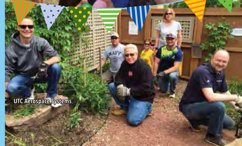
UTC Aerospace Systems