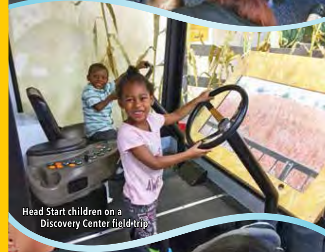
Head Start children on a Discovery Center field trip